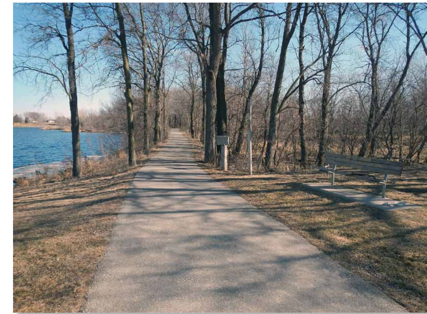
Lakeshore Park Trail

More than 85% of respondents who answered this question indicated that they visited a park during the past year. More than 30% of respondents visited a park at least once a month, and more than 20% go to parks at least three times per week.