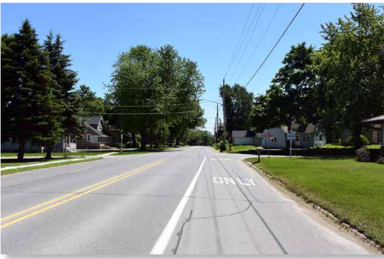
Existing Intersection Conditions