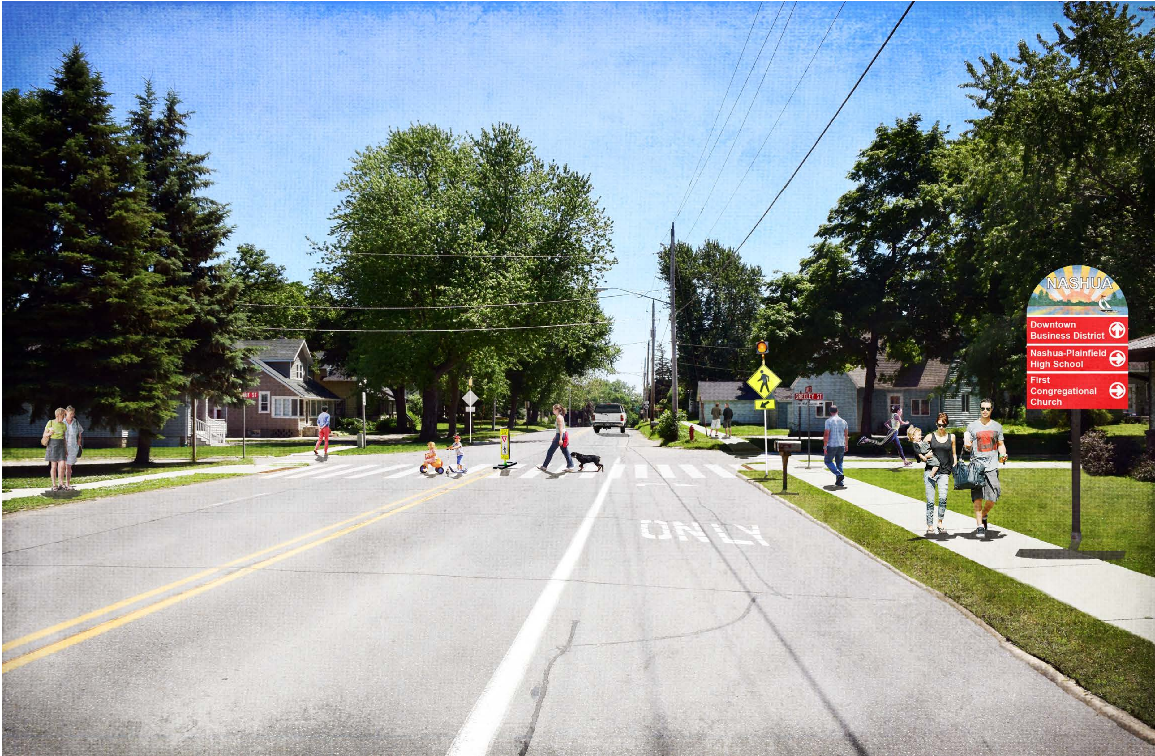
Enhancements at Intersection of Highway 346 and Greeley Street

New commercial developments near the intersection of State Highway 346 and Amherst Boulevard have no sidewalks, making access difficult and unsafe for pedestrians. A proposed sidewalk to provide safe access the Dollar General Store, Subway, and Welcome Center is shown on the plan. The property owners would also benefit from the new sidewalks and may be willing to pay for this project.